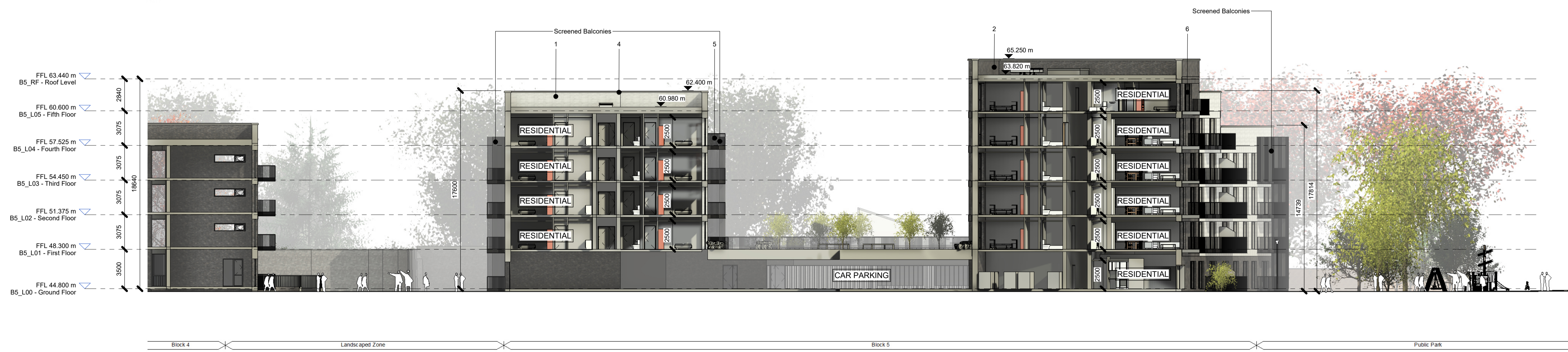
Block 05, E/W Section B-B 1 : 200

Notes: - Do not scale from this drawing. Use figured dimensions in all cases. - Verify dimensions on site and report any discrepancies to the Architect immediately. - This drawing is to be read in conjunction with the Architect's Specification. - © This drawing is copyright and may only be reproduced with the Architect's permission.